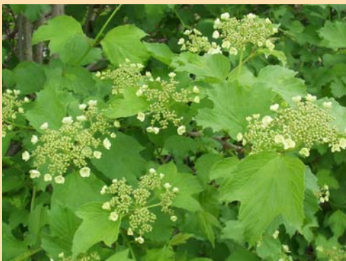
Is this innocent viburnum next?

If spotted: Don't panic. Take action to defend our country's viburnums. Join with other Citizen Scientists and report sightings to the Viburnum Leaf Beetle Citizen Science Project. Visit the VLB website for more pictures, management information, and online reporting forms for submitting your local observations.