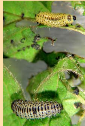
2nd, 3rd Instars May-June