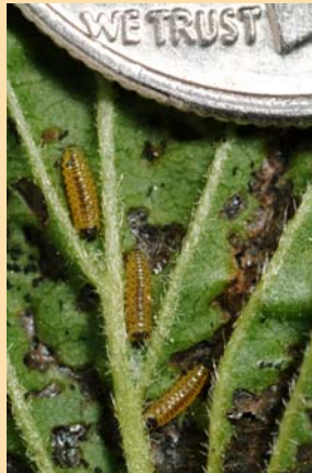
Larvae Hatch Late April-May